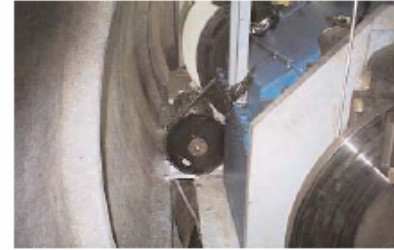
Rotating the Shaft

Brush plating provided a viable, cost effective alternative to removing and reinstalling the entire assembly after repairing it on the bench. The R&R operation was estimated to be a 10 to 14 day, $100,000 job. The brush plating repair was completed in approximately 40 hours with less than $1,000 in material costs.